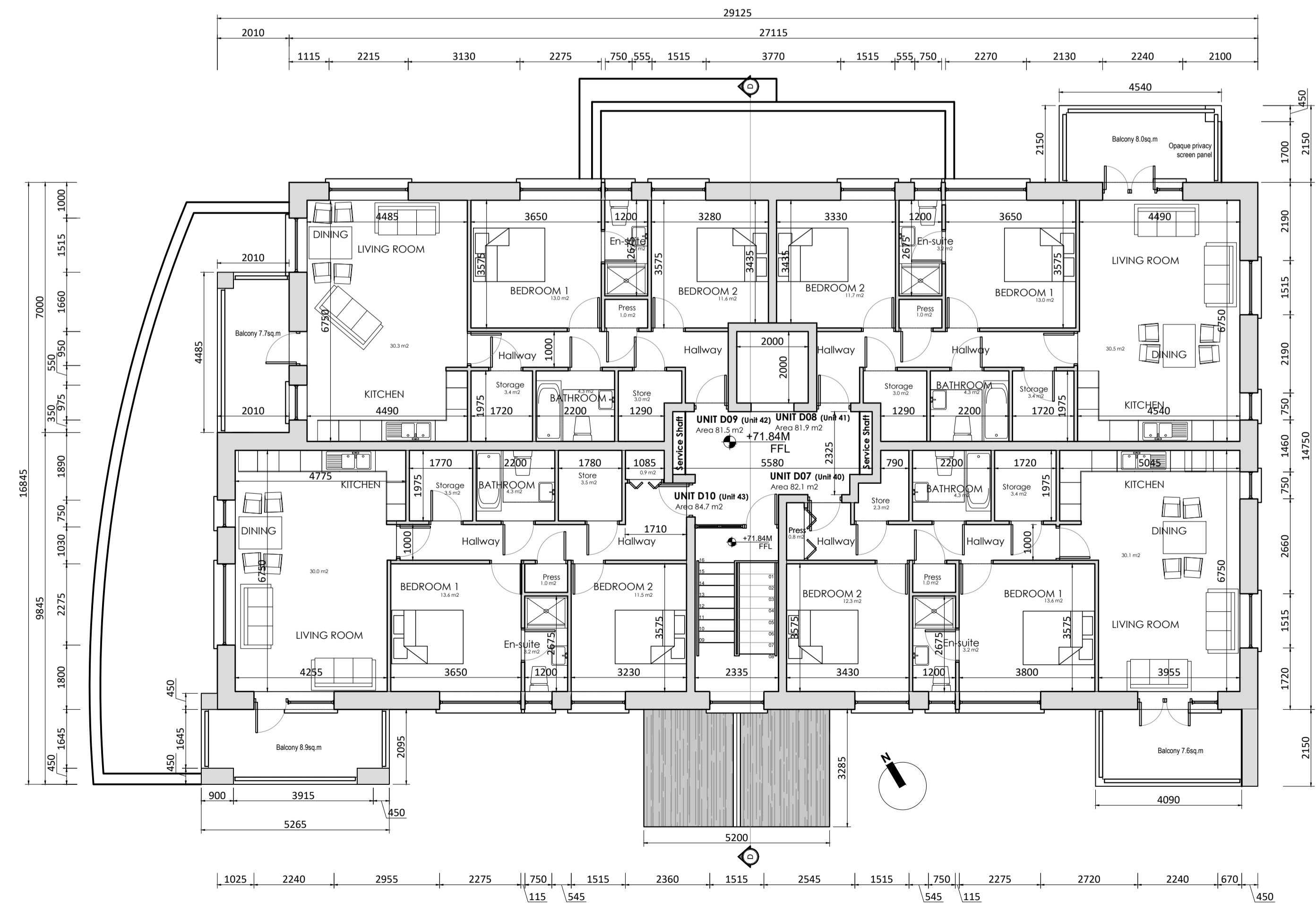
Block D - Second Floor Plan